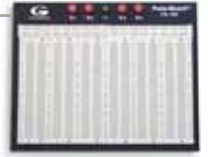
PB-10 PB-60 PB-70 PB-83 PB-103 PB-104 PB-105